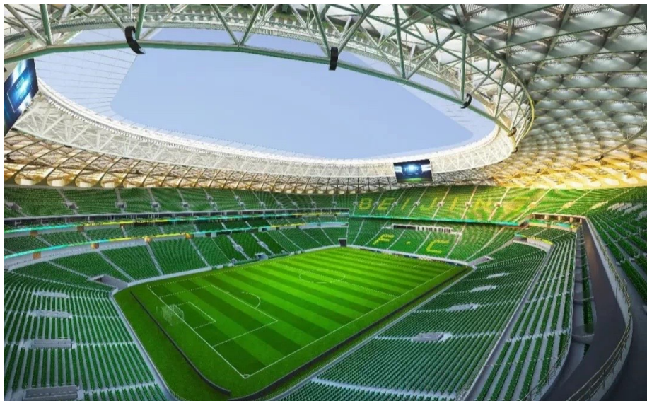
(Effect drawing of the new worker body)

Gongti also carries the common memory of many people. In those years, we have seen the National Games, the Asian Games, the Olympic Games and the concerts of major stars here. The nearby bar street is also a favorite gathering place for young people... Now, we will witness the birth of the "wisdom worker body" together. Today, we formally joined hands with Zhonghe Group to jointly help "Xin Gongti" become a world-class smart sports service complex.