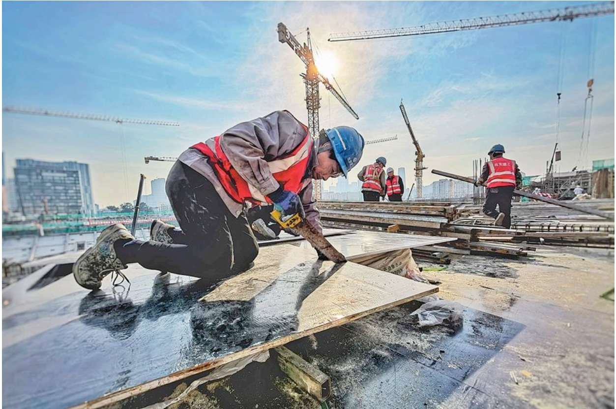
Workers prepare construction material in October last year.