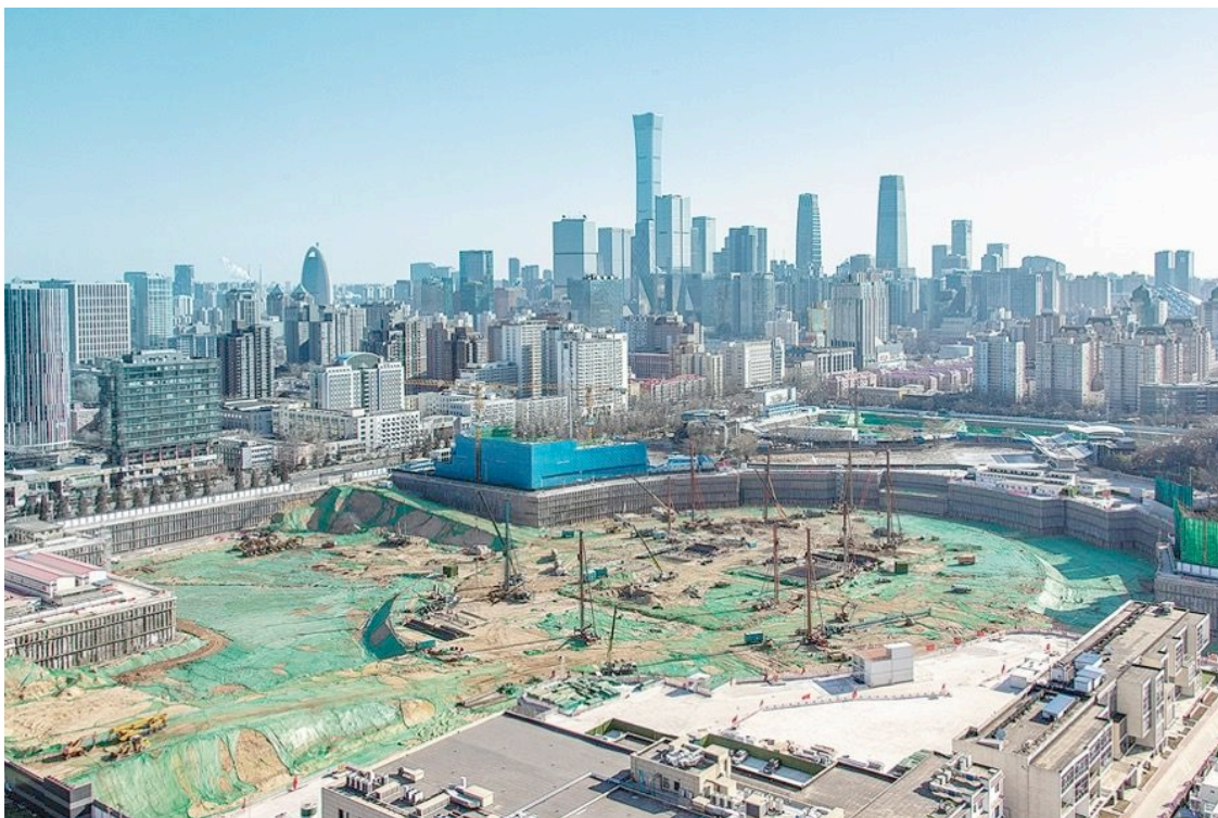
Construction of piled foundation is underway in February 2021.