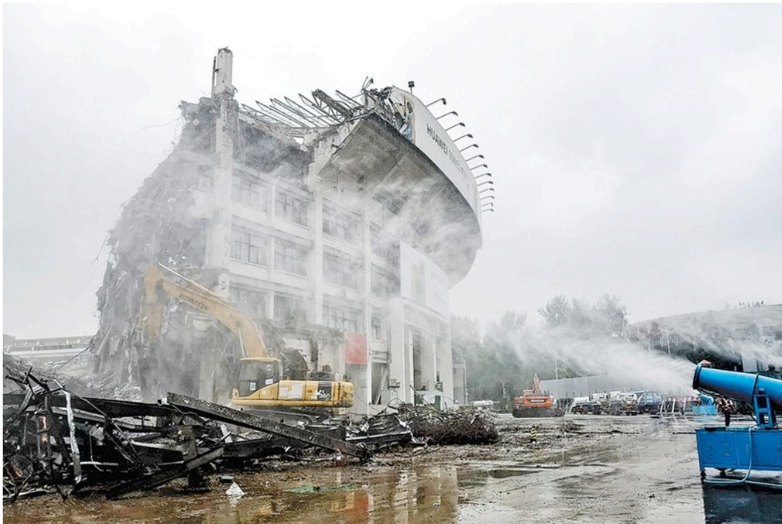
Cannons spray water to control dust during the demolition of the old Beijing Workers Stadium in August 2020.