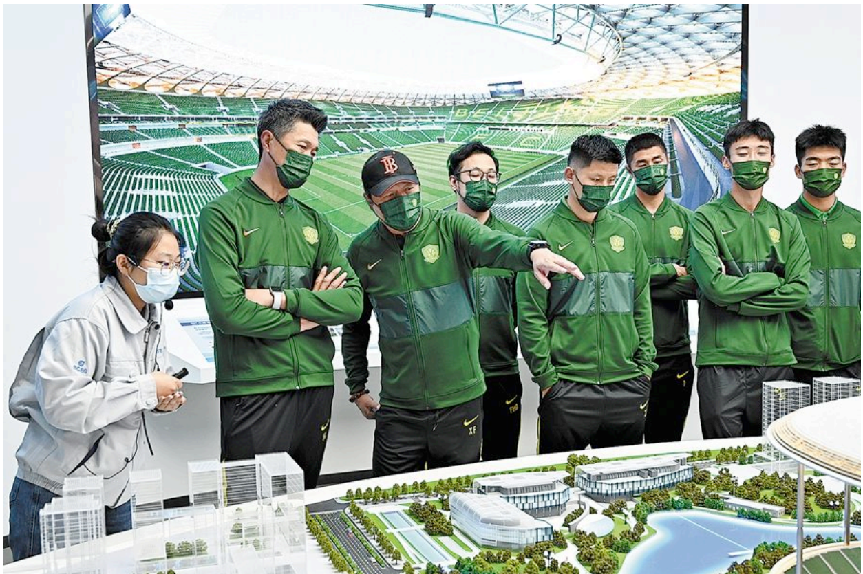
Players and coaches of the Beijing Guoan Football Club, which used the stadium as its home field for over 20 years, view a model of the new stadium in April.