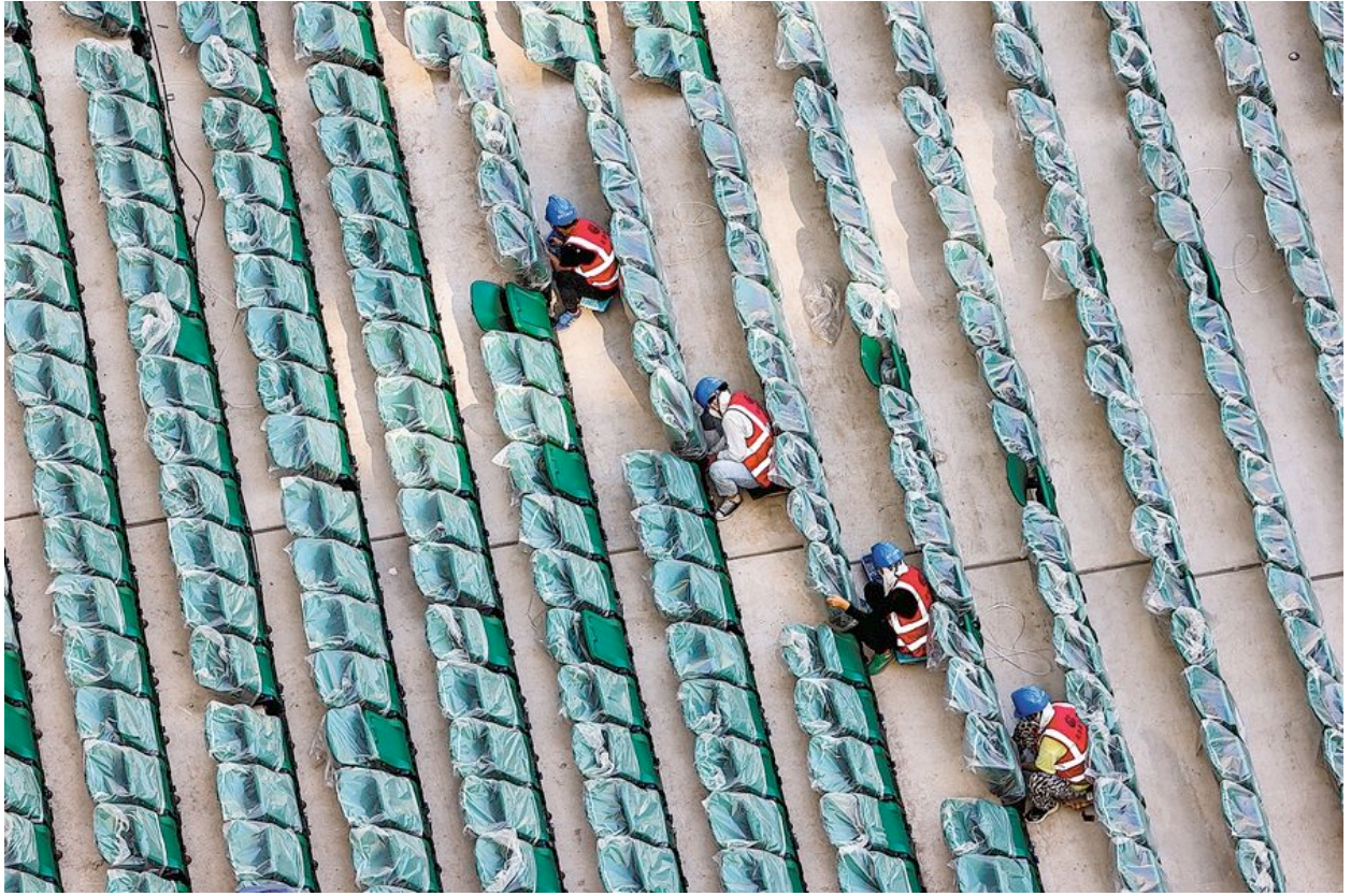
Workers install seats in the stands area in August.