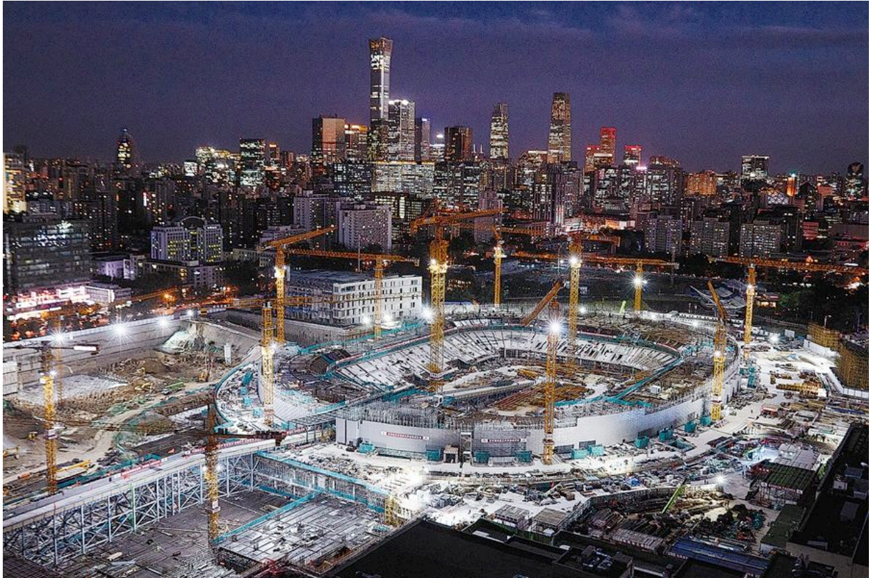
Concrete construction of the new stadium's main structure is underway in October 2021.