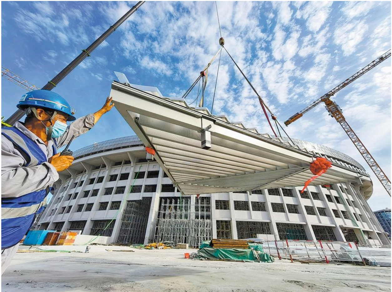
Roofing that can absorb noise is installed in July.