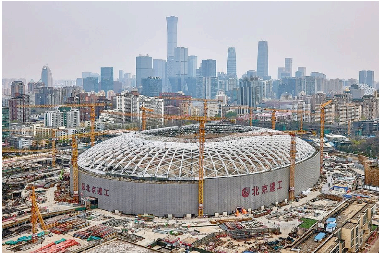
The steel structure is completed in April.