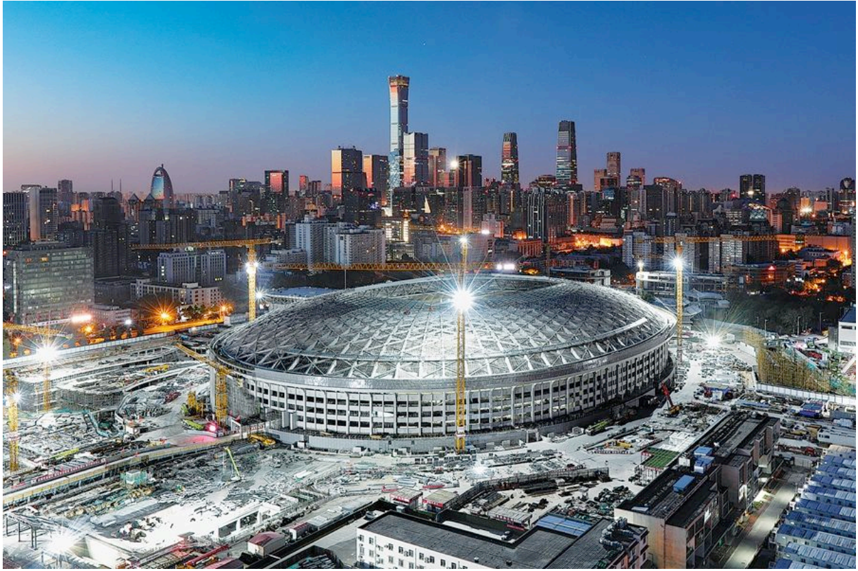
The unitized curtain wall of the roof is completed in May.