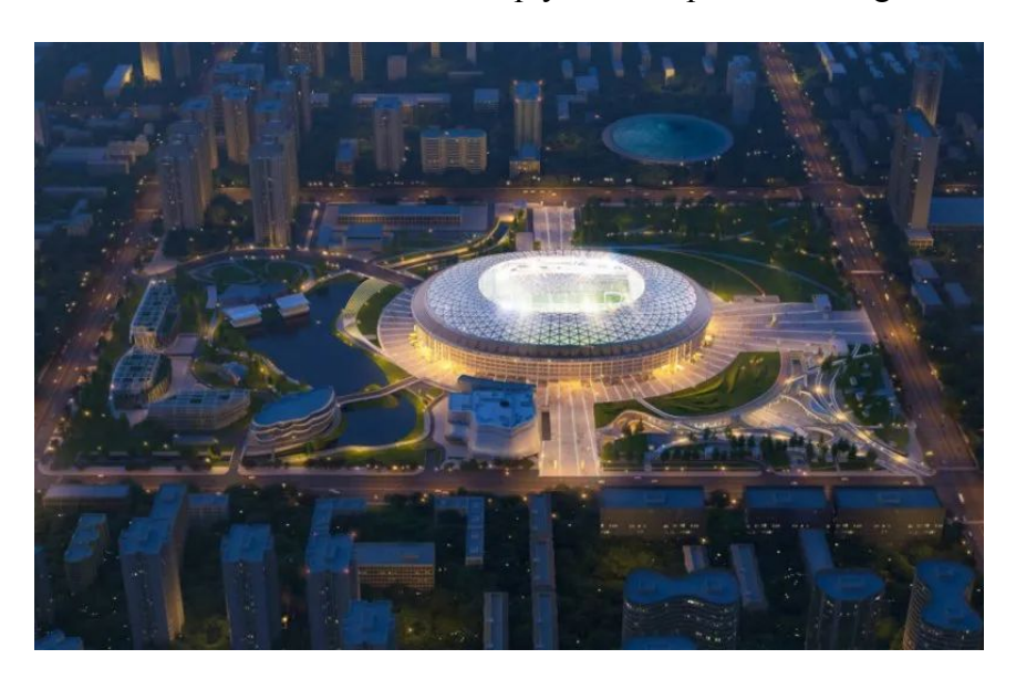
An artist's rendering of what Gongti will look like in the future when the lights are on

A I believe that Gongti will attract large crowds of people once it opens because many fans are drawn to the concept of sportsmanship, which is what makes Gongti stand out. Also, compared to other event venues, Gongti has a bigger capacity, which means that we are able to host large-scale events that other venues simply aren't capable of doing.