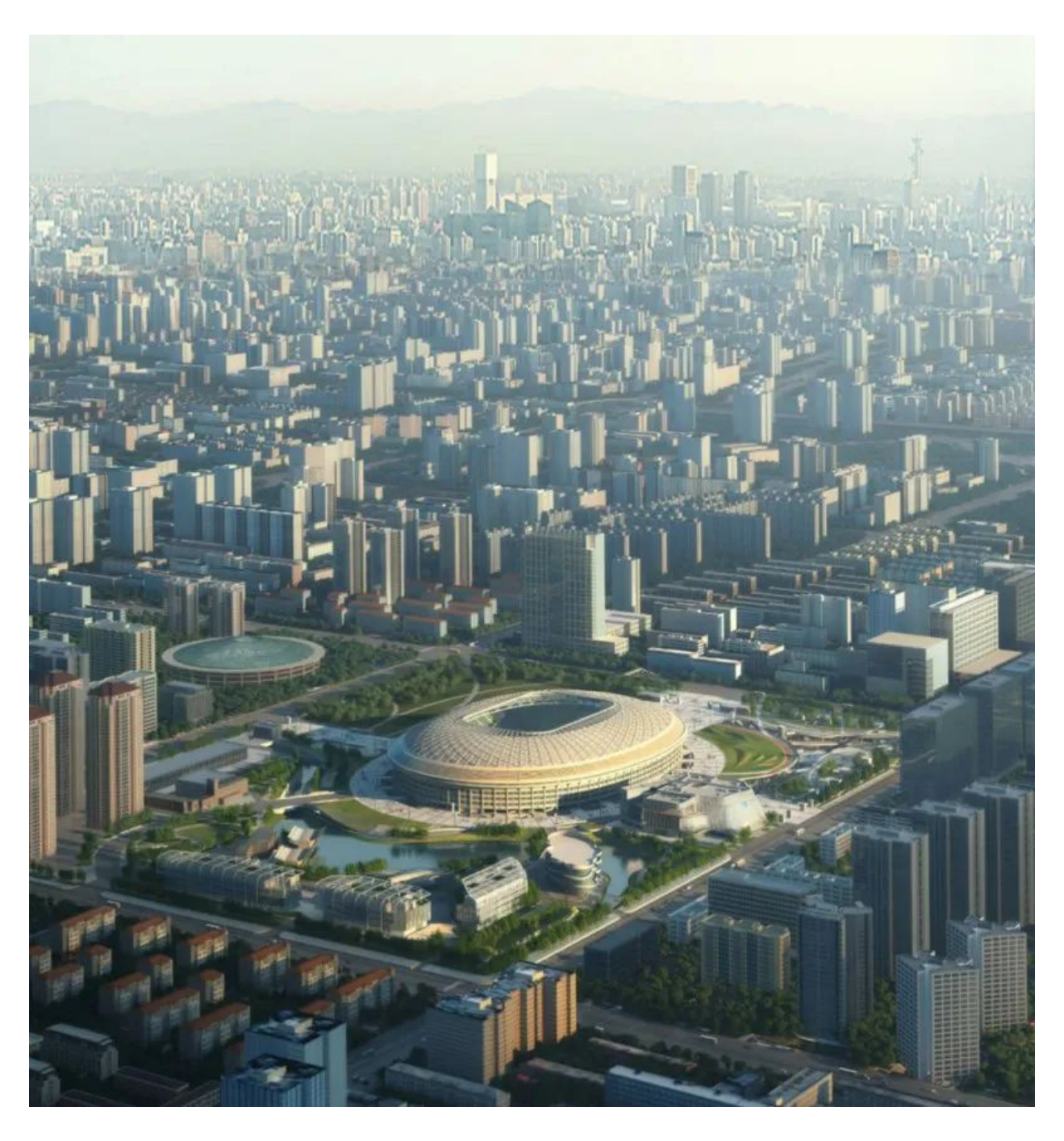
An artist's rendering of a birds eye view of future Gongti

In 1996, Beijing Guo'an found its new home at Beijing Workers' Stadium, which has been home to the soccer team now for more than 20 years. I am certainly very proud to be able to get involved in this project and become a part of its history.