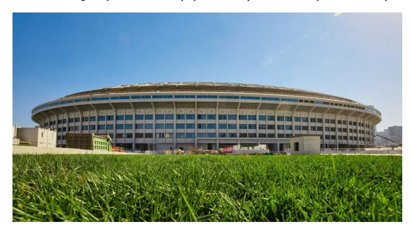
West gate of the new Workers' Stadium

Beijing Workers' Stadium, home to a range of large-scale sports events including the 1990 Asian games and some soccer matches during the Beijing 2008 Summer Olympics, will soon have a new look follwing a major reconstruction project that is expected to finish by December this year.