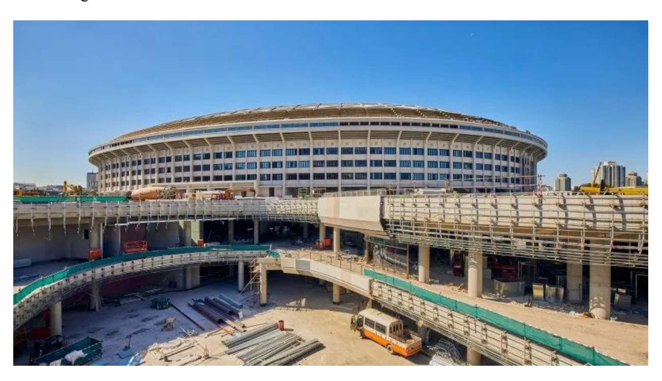
A sneak peek of the sunken and underground commercial space

A There are three main changes that have been made to Gongti. The original stadium had a running track, but after the revamp, the running track has been removed. Another big change lies in how Gongti will be used. More than 100,000 square meters of commercial facilities have been added to the complex, transforming the area into an entertainment venue where people can eat, shop and dine. The new stadium also features a giant underground plaza which soccer fans and fitness enthusiasts can explore. Moreover, the Beijing municipal government has also designed a station for subway Line 3 and 17 to specifically connect to the Workers' Stadium in order to ease traffic congestion.