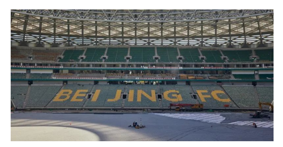
Workers' Stadium has been home to Beijing Guo'an for more than 20 years

A When fans walk into the stadium, they'll be able to notice a movable stand in the south area of the stadium. These stands are designed in such a way that they are able to stretch and move around for future concert needs. Right now we've been working out the specifics to ensure that the stage will not damage the turf. We have certainly taken fans' suggestions into consideration and yes, the new Gongti will be able to host concerts. It could possibly even host events like motorcycle sports, fashion shows, and ice hockey games during winter in the future.